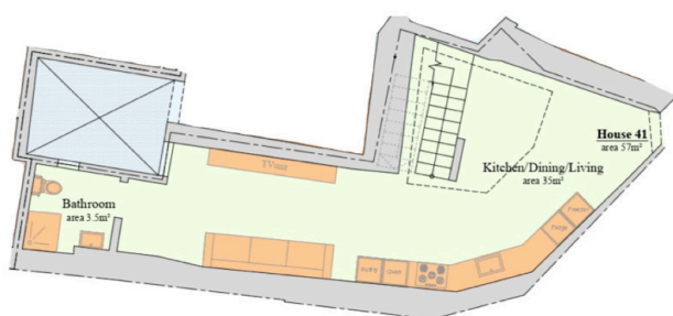
Proposed Ground floor Plan Scale 1:100