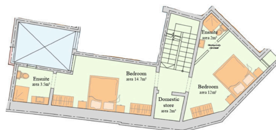
Proposed First floor Plan Scale 1:100