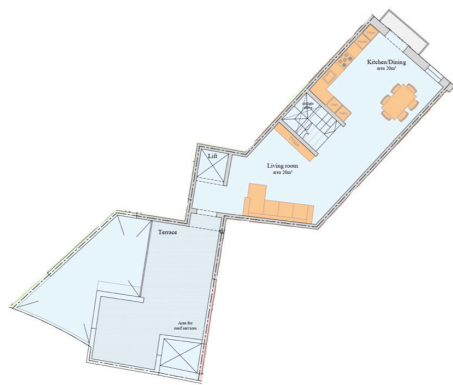
Proposed Second floor Plan Scale 1:100