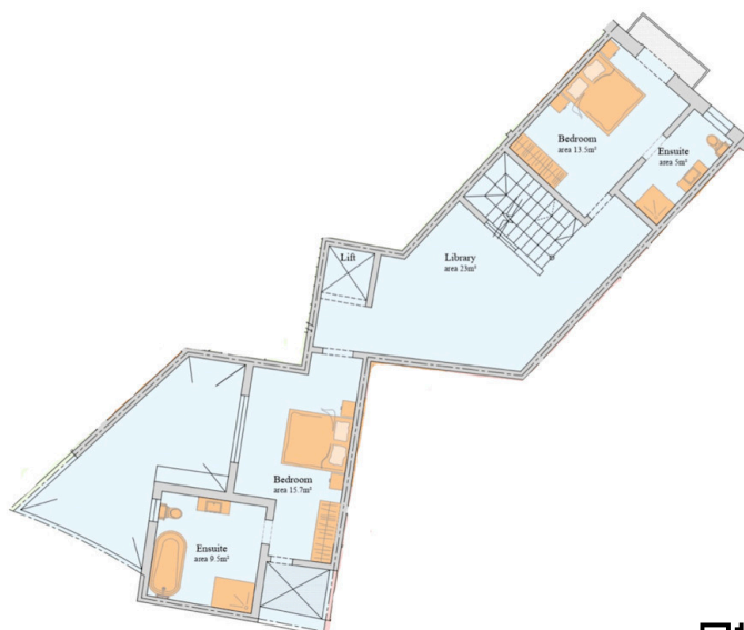
Proposed First floor Plan Scale 1:100