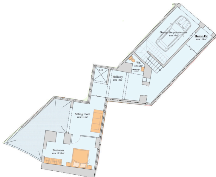
Proposed Ground floor Plan Scale 1:100